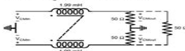
Figure 3. A first order (single pole) common mode filter

The value of inductance required of the choke is simply the load in Ohms divided by the radian frequency at and above which the signal is to be attenuated. For example, attenuation at and above 4000 Hz into a 50Ω load would require a 1.99 mH ( 50/(2\pi \times 4000) ) inductor. The resulting common mode filter configuration would be as follows: