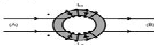
Figure 2. The common mode inductor

The design of a common mode filter is essentially the design of two identical differential filters, one for each of the two polarity lines with the inductors of each side coupled by a single core: