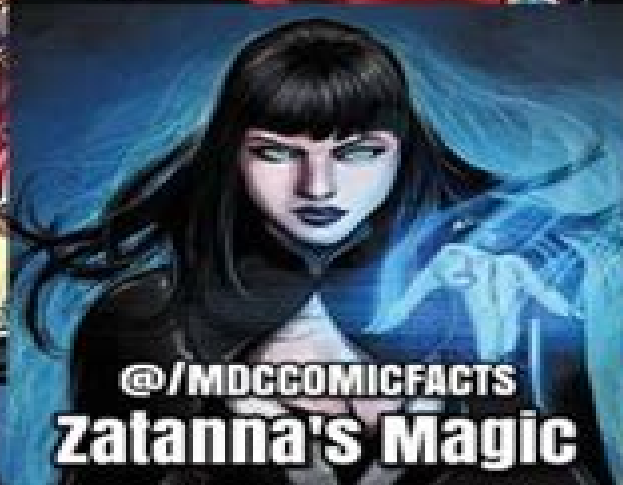
Zatanna's Magic