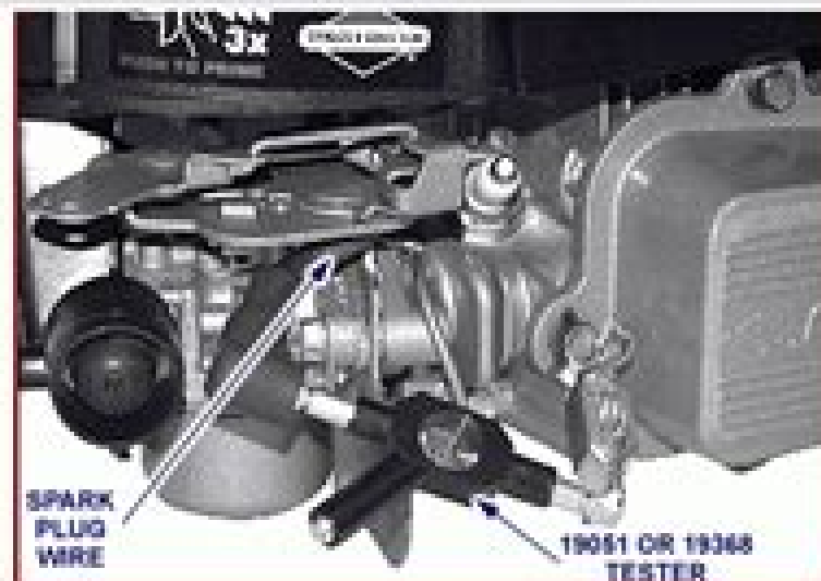
Fig. 1 - Check For Spark

Note: On all engines equipped with MAGNETRON® spark will also be observed at the tester when there is a sheared flywheel key.