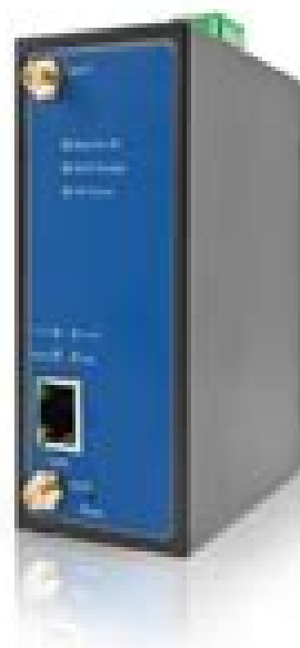
Industrial Wi-Fi Access Point and Client DM500