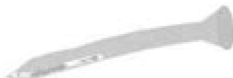
An old nail gets rusty.