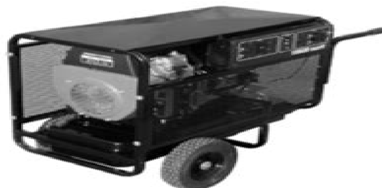
Figure 3 – Model 3WY47