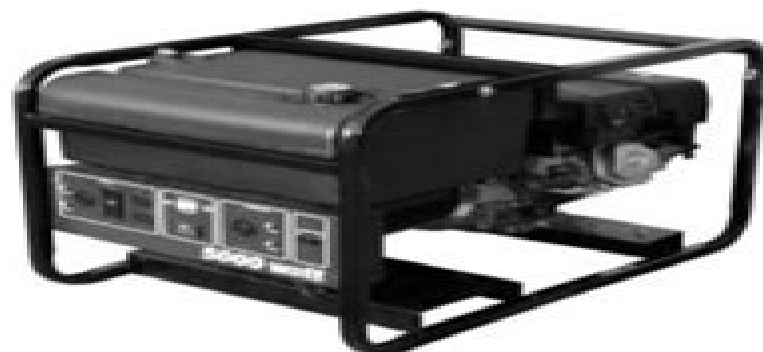
Figure 2 – Models 3W736C, 3WY44, 3WY46, 3TE27A, and 3WY45