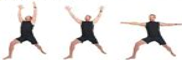
#9 ROAD WARRIOR 1 & 2