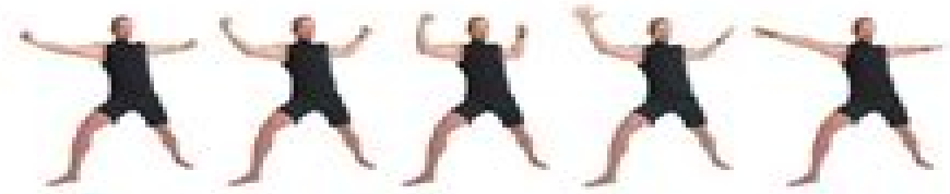
#10 DYNAMIC RESISTANCE CABLES