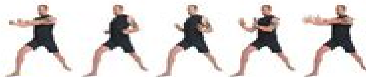
#11 DYNAMIC RESISTANCE ROWS