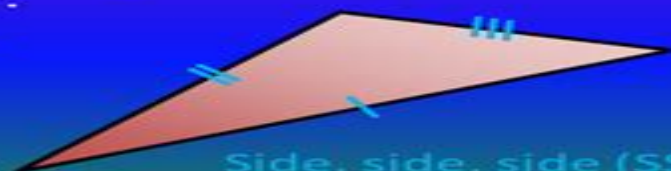
Side, side, side (SSS)