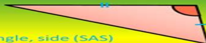
Side, angle, side (SAS)