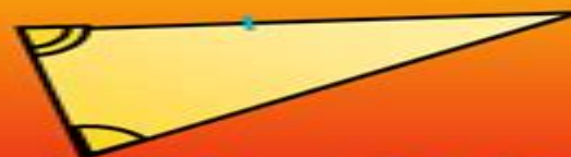
Angle, angle, side (AAS)