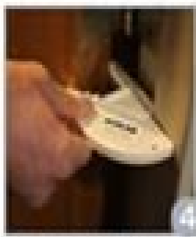
4 Open doors, place wet floor signs.