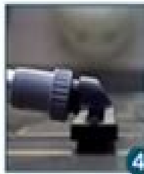
4 Vacuum up the solution.