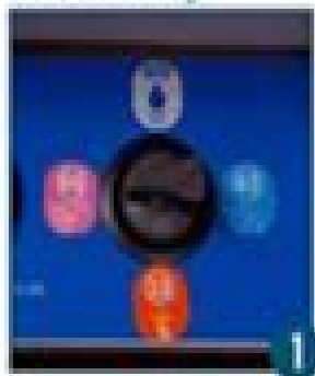
1 Select cleaning product.