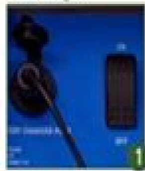
1 Clean, then charge the Cleaning Caddy.

⚠ WARNING: Do not spray electrical outlets, drywall or other sensitive surfaces.