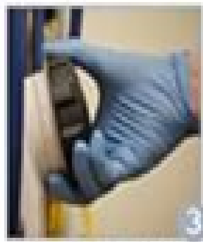
3 Fill water and replace product, if necessary.