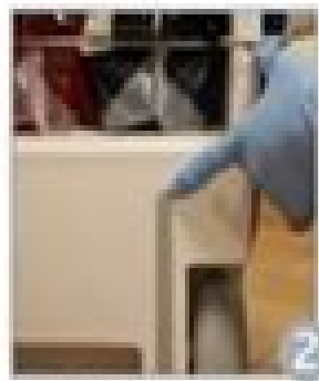
2 Check water and product levels.