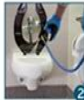
2 Spray toilets, urinals, fixtures, counters, sinks and faucets.