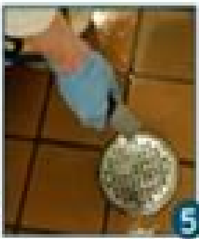
5 Empty wet-vacuum on the Cleaning Caddy.