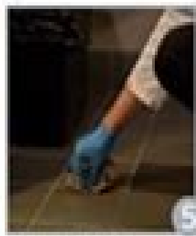
5 Pick up debris.