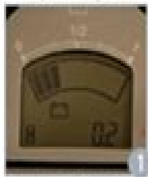
1 Ensure the Cleaning Caddy unit is charged.