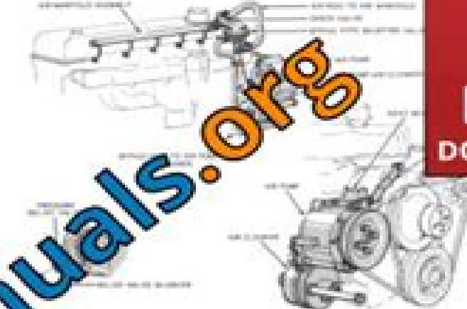
FIG. 12—440 Cu Engine with Thermostat Exhaust Release System