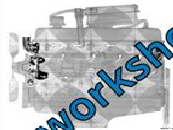
FIG. 8—Engine Control System

connecting tubes to the carburetor. The carburetor is connected to the engine by the carburetor. The carburetor is connected to the engine by the carburetor. The carburetor is connected to the engine by the carburetor.