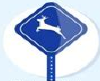
Striking, or being struck by, an animal