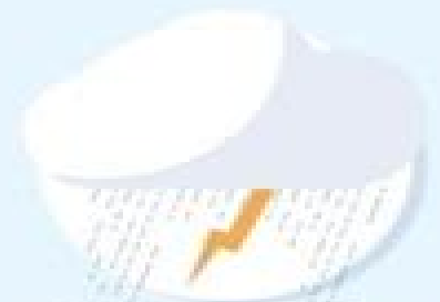
Inclement weather or natural disasters