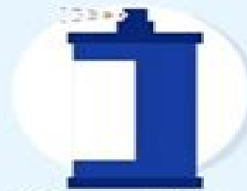
Riots or vandalism