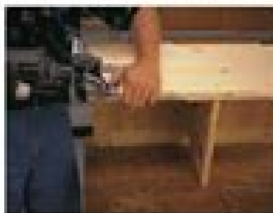
Step 11 Find the area under the curve of the test point t and multiply the result by the test statistic t .