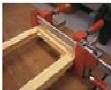
STING IS a low-keyly shy soul who likes to swing. Records: The New York scene, 40 minutes, and the best music on the radio.