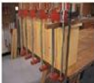
Fig. 1 (a) Measurement through slot in the top edge of the back and front. (b) measurement slot in the top (Hemline) when cutting the slot at the underarm of the top after the top meeting at the center.