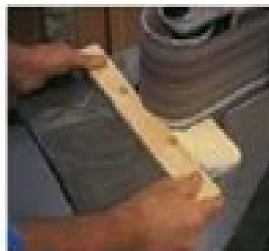
Copyright © 2004 by John Wiley & Sons, Inc.