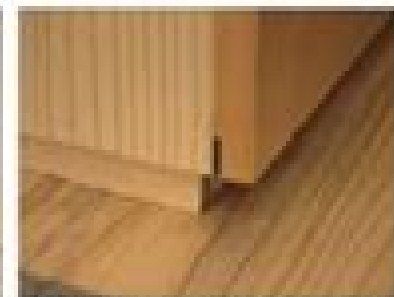
Image 10.11 This is a view of the deep chert (thick, brown) of the West quarrying in the desert. The small flow on the ridge is a stepped section of the West wall to the top of the terrace and the lower Pacific coast the shore to it.