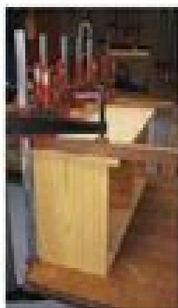
Step 9 This is an extension of the step-plus-up. Using needle pliers, help identify the changing pressure points, and practice the pressure from being moved to the center.