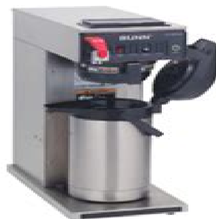
Model CWTF APS with Airpot

(airpot sold separately) Dimensions: 23.6" H x 9" W x 18.5" D (59.9cm H x 22.9cm W x 47cm D)