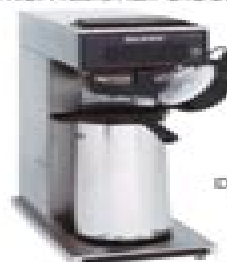
Model CW15-APS with Airpot

(airpot sold separately) Dimensions: 23.6" H x 9" W x 18.5" D (59.9cm H x 22.9cm W x 47cm D)