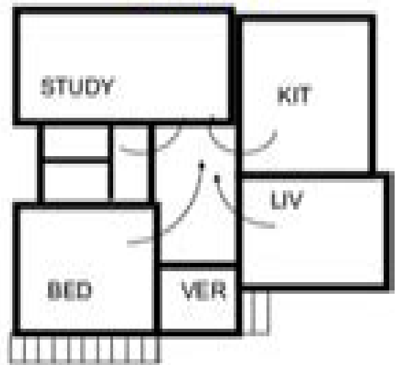
BAD CIRCULATION WITH OUTSIDE STAIR