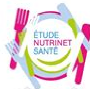
TABLE DE COMPOSITION DES ALIMENTS