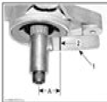
FIGURE 1-15 FRONT DIFFERENTIAL 1. Backlash measurement tool 2. Scribe at 1 in 3. 25.4 mm (1 in)

From center of tool bolt, measure 25.4 mm (1 in) and scribe a mark on the flange.