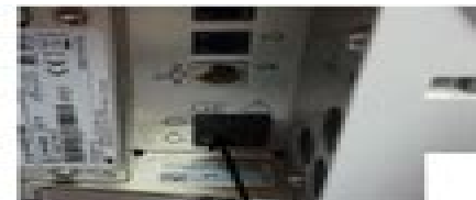
Hard on/off power switch