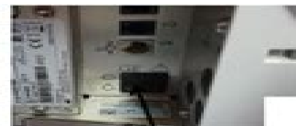
Hard on/off power switch