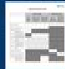
BACF Covered Auto Symbols