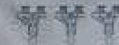
© 2000 Blackwell Science Ltd Journal of Internal Medicine 247: 395–402

© 2004 Blackwell Publishing Ltd, Journal of Internal Medicine 255: 105–112