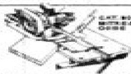
CAT. NO. 79-002 BITTER & DAW GUIDE

Professional Router cuts made easy. Holds Black & Decker and other popular routers securely on workpiece base top. Over a solid frame off support for all types router cuts.