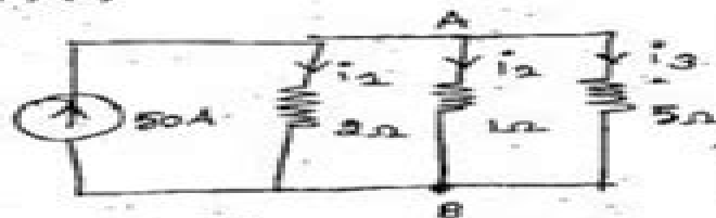
Fig. 11 (a) (ii)