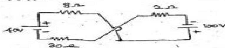
Fig. 11 (a) (i)