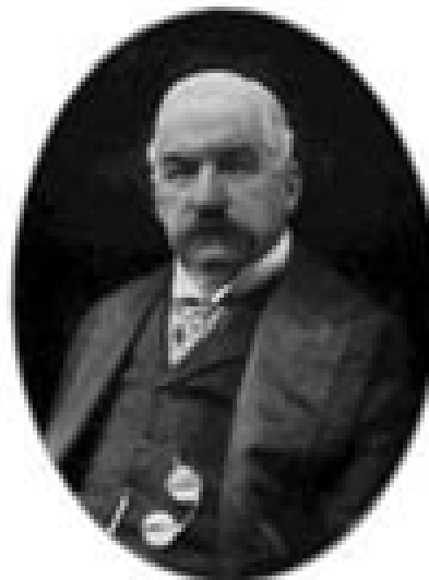
John D. Rockefeller