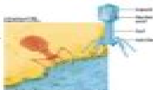
Figure 18-15 The following virus has a spherical head and a tail. The tail is made of protein and is used to attach to a host cell.