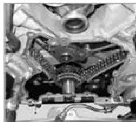
Fig. 13. Identifying Sealant Path For Timing Case Cover - Engine 3.0L

The sealant must be applied in the upper area of the timing case cover in the center area of the sealing surface because the sealant is distributed downwards due to placement of the timing case cover.