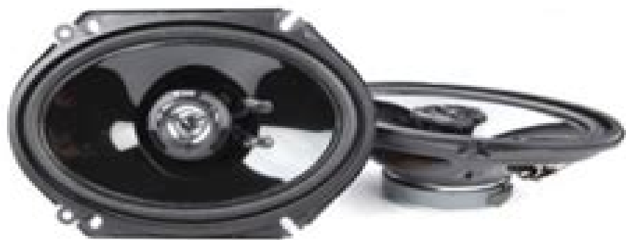
6x8 inch coaxials