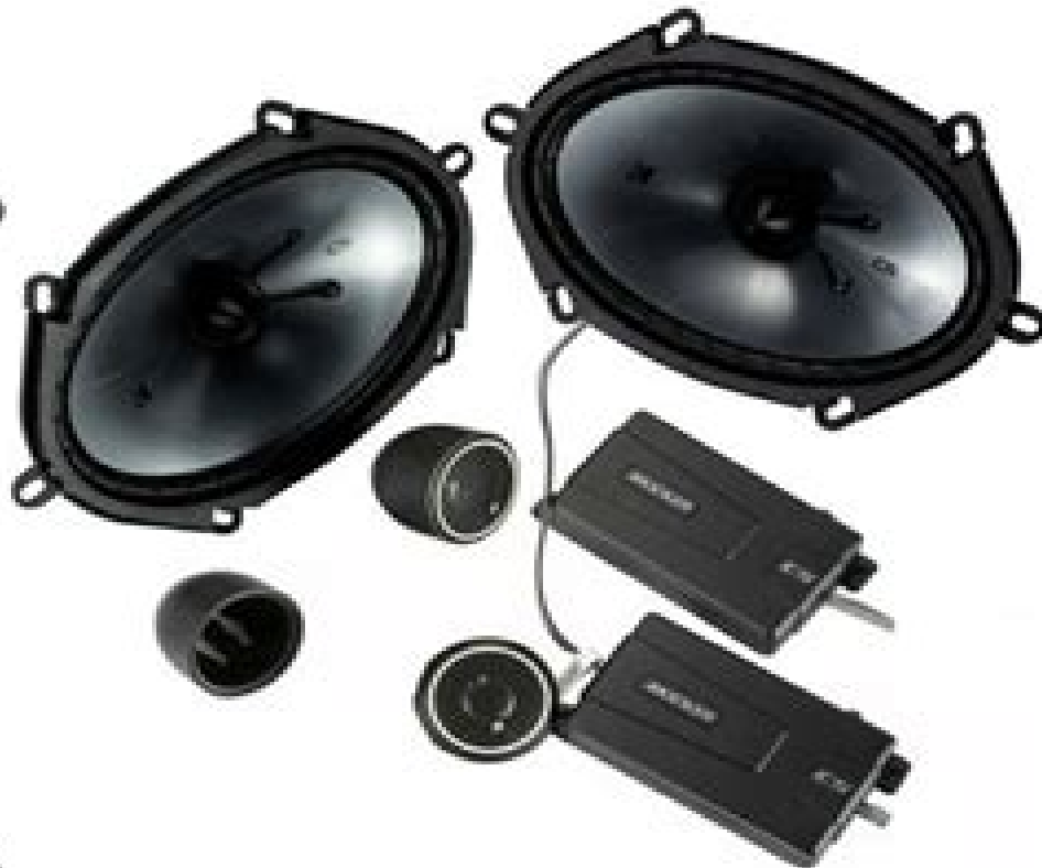
6x9 inch component set