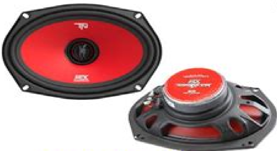
6x9 inch coaxials

Typical installation cutout opening (approximate)