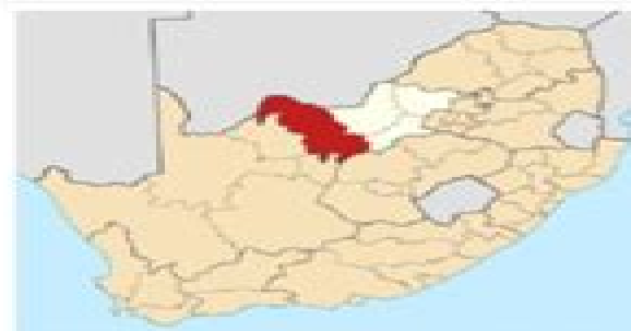
Location in South Africa