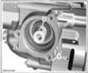
1. Crankshaft locking bolt 2. Lock nut with cone