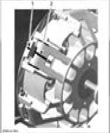
1. Mark on drive pulley locking nut 2. Mark on governor cup

CAUTION: Prior to removing the drive pulley, mark sliding rail and governor cup together to ensure correct reinstallation. There are only 4 grooves mounted out of 8 possible positions.