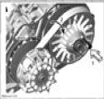
1. Drive half of drive pulley assembly 2. Remove pulley from belt

To remove belt no. 4, slip the belt over the top edge of sliding rail, as shown.