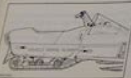
The engine has its own number.