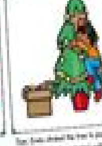
Then, Luke decided the tree to place the star, but the tree started wobbling.