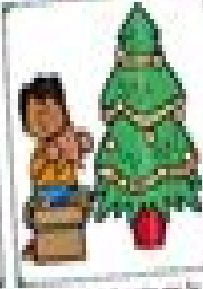
Next, Luke picked a star for the top of the tree.