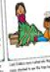
Last, Luke was careful not to move the star, so the tree fell to the ground.