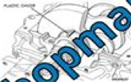
Fig. 5 Measure Crankshaft Journal O.D.

CAUTION: Do not rotate crankshaft or the plunger will be damaged.