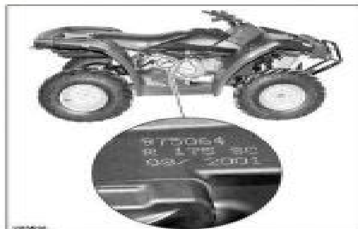
E. L.V. (ENGINE IDENTIFICATION NUMBER)