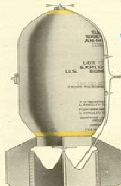
AN-M65A1 1000-LB. GP BOMB