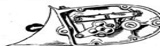
Clutch mechanism installed