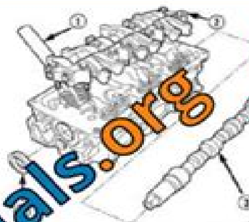
Fig. 186: Spark Plug Tube, Rocker Arm Assembly, Camshaft & Seal Courtesy of CHRYSLER LLC