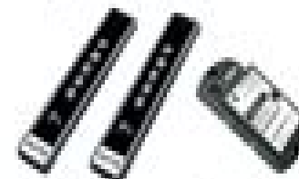
Wireless push switch