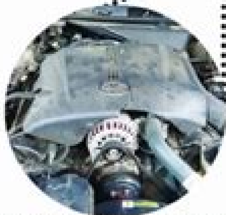
Issues with sensors found throughout the engine