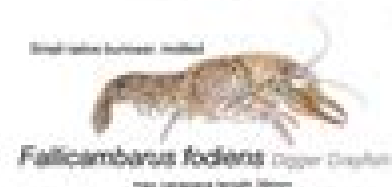
Fallicambarus fodiens Digger Crayfish max carapace length 100mm