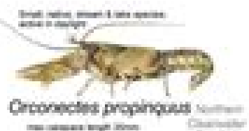
Orconectes propinquus Northern Copper Crayfish max carapace length 100mm

Orconectes propinquus Rostrum: white, the edge is serrated Chelae: small, with a dark and light banding Abdomen: jointed, brown with or without markings Respiratory apophysis simple