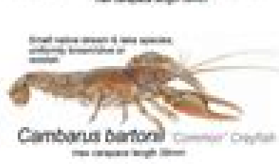
Cambarus bartoni Common Crayfish max carapace length 100mm