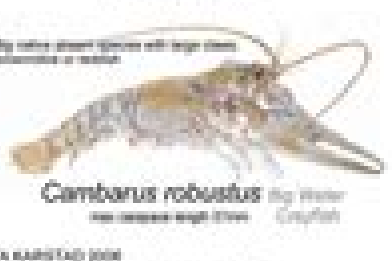
Cambarus robustus Big Water Crayfish max carapace length 150mm