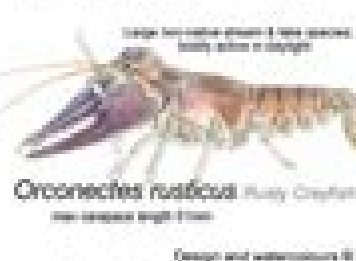
Orconectes rusticus Rusty Crayfish max carapace length 150mm

Orconectes rusticus Rostrum: white, the edge is serrated Chelae: small, with a dark and light banding Carapace: white, with brown, brownish, or greenish Respiratory apophysis simple