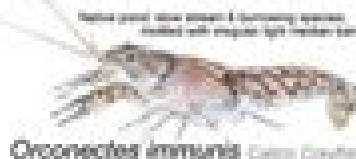
Orconectes diogenes Dwarf Crayfish max carapace length 100mm

Orconectes diogenes Rostrum: white, curved Chelae: smaller, with a dark and light banding Carapace: white, with brown, brownish, or greenish Respiratory apophysis simple