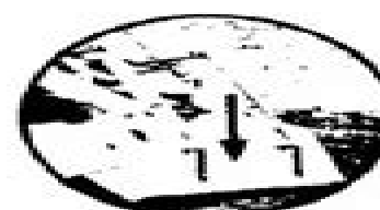
PART NUMBER OF STANDARD BUCKET