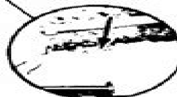
SN OF FRONT DRIVE AXLE