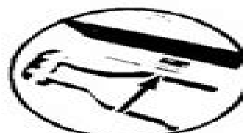
PART NUMBER AND SN OF 4-IN-1 BUCKET