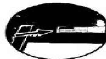
SN OF ROPS CANOPY