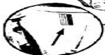
SN OF BACKHOE