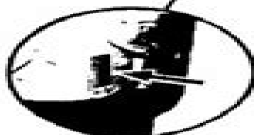
SN OF TRANSAXLE