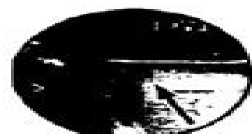
PRODUCT IDENTIFICATION NUMBER