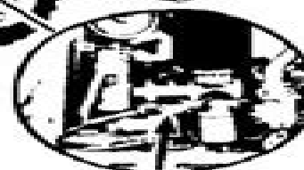
SN OF ENGINE