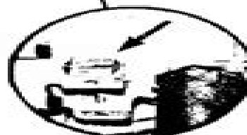
SN OF POWER SHUTTLE