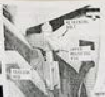
Tension Rod with Self-Locking Nut

NOTE: Cab Models: You must remove the rear floor plate and the rear panel under the rear window.