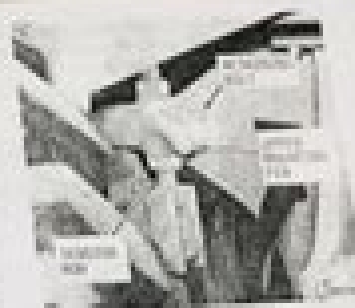
Tension Rod with Two Lock Nuts