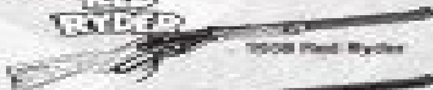
1000 Red Eyes