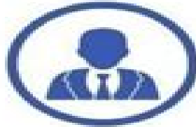
YOUR OWN BUSINESS