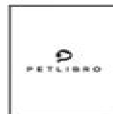
User Guide Kit