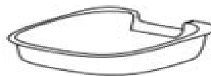
Stainless Steel Bowl