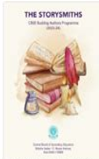
Budding Authors English (Second Edition)