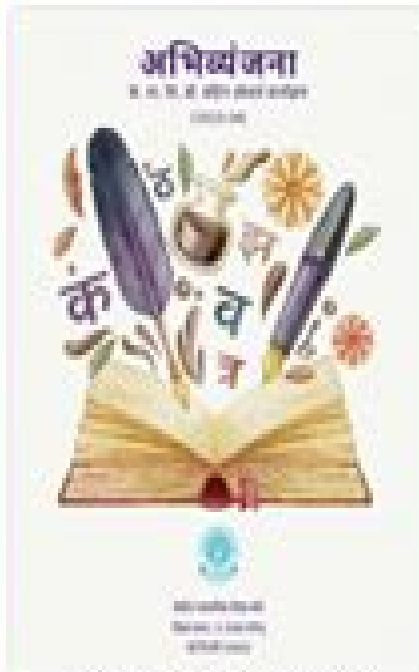
Budding Authors Hindi (Second Edition)