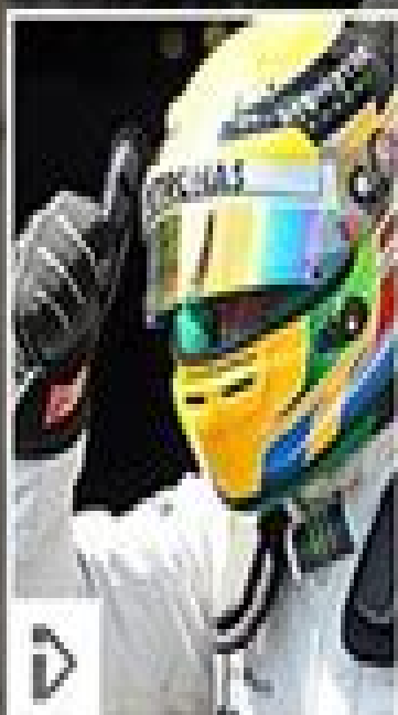
F1 Japan Live Qualifying