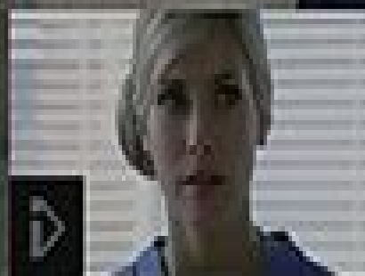
Holby City Episode 7