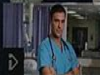
Doctors Episode 10