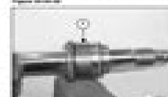
Remove the top cover of the hydraulic pump. Page 20-10-1