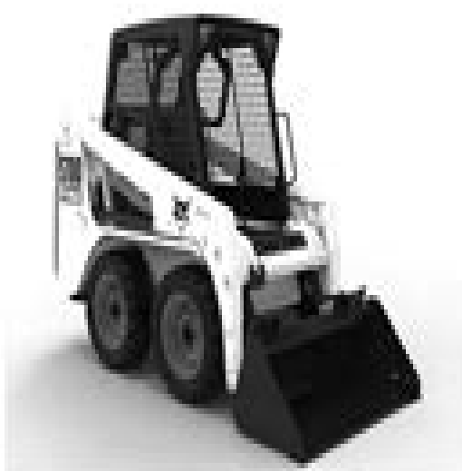
Illustration Courtesy: Bobcat Skid-Steer Loader

S100 Skid-Steer Loader S/N 580000001 & Above