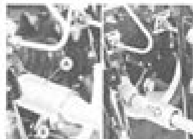
A, Propeller Shaft Sliding Joint B, Crank