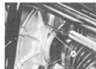
A, Front Axle Cap Bolt