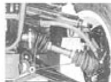
A, Front Axle Joint Bush