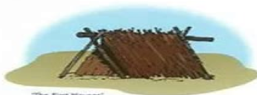
"The First Houses"