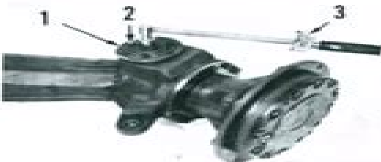
Fig. 8—Install special plate ACTP-3080 (1) on upper king pin, then use a torque wrench (3) to measure torque required to turn planetary unit. Install shims on lower king pin only to adjust king pin bearing preload.

Refill final drive housing and axle housing to correct levels with Allis-Chalmers Power Fluid 821 or equivalent.