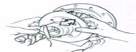
Fig. 10—Use a depth micrometer to measure distance from edge of case to end of side gear to determine thickness of thrust washer required to provide proper end clearance. Refer to text.

Install differential support housing into axle housing and tighten mounting cap screws to 83 ft.-lbs. (113 N·m) torque. Reinstall axle shafts and final drive units. Reinstall axle assembly under tractor. Refill axle housing and final drive housings to correct levels with Allis-Chalmers Power Fluid 821 or equivalent.